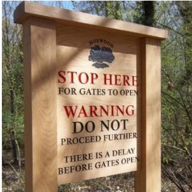
Information Signage Board